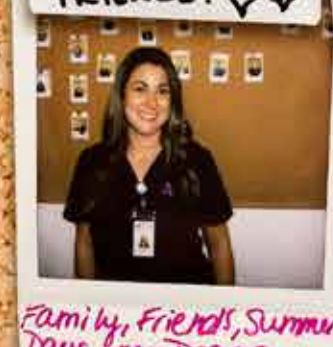
Family, Friends, Summer Days, my Dog ♡