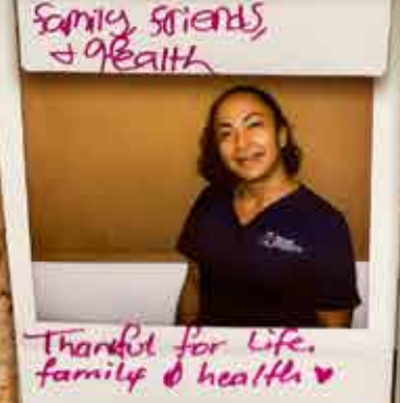
Thankful for life, family & health ♡