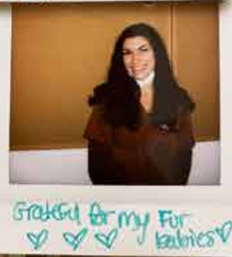
Grateful for my Fur babies ♡