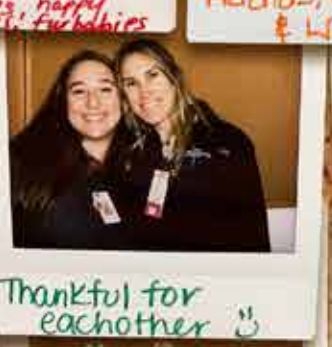
Thankful for each other ☺