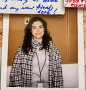
Our amazing Staff ☺ + coffee