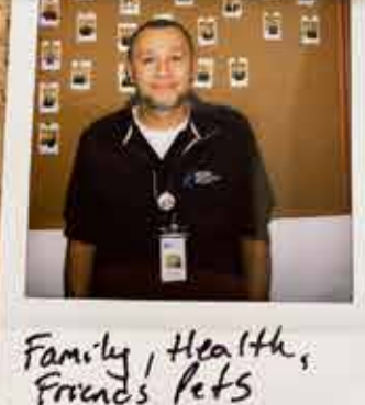
Family, Health, Friends, Pets