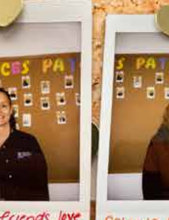
Family, Friends, love good times, happy memories, hobbies