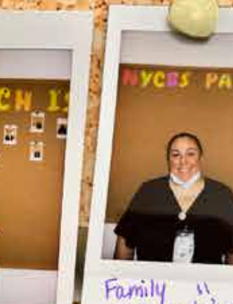
my family, pets + health job!!