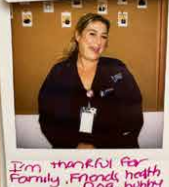
I'm thankful for Family, Friends, health, Dog, hobby