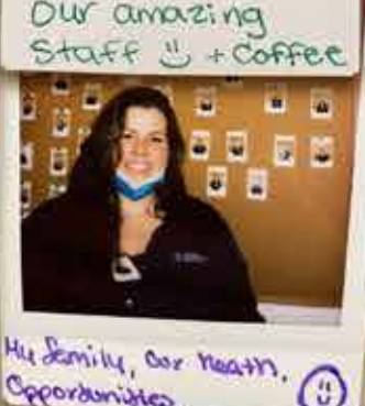
My family, our health, opportunities. ☺