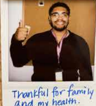
Thankful for family and my health.