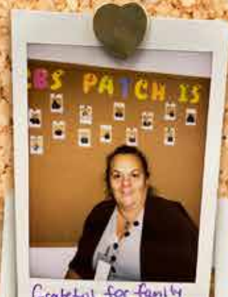
Grateful for family Friends & getting up every morning!!