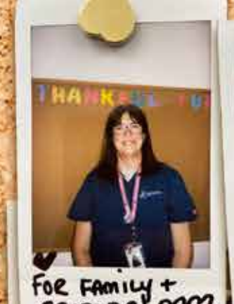
FOR FAMILY + FRIENDS. ♡♡