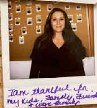
I am thankful for my kids, family, friends & work family