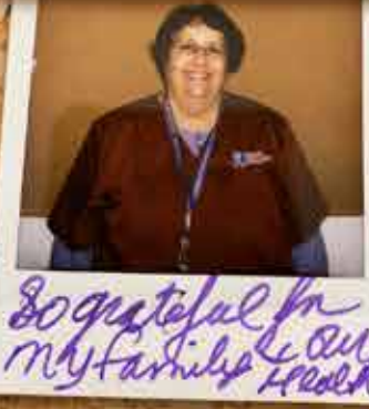
So grateful for my family & health!