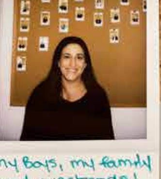
my boys, my family and weekends!