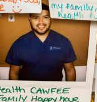
Health CAWFFEE Family Happy hour