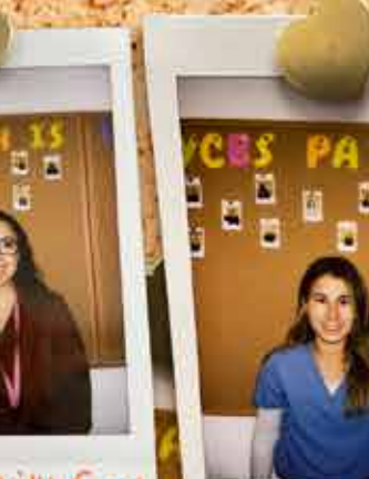
Friends, family, food, & wine ☺