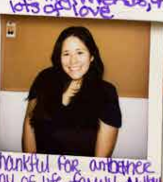
Thankful for another day of life, family, Milky + Pretty Girl