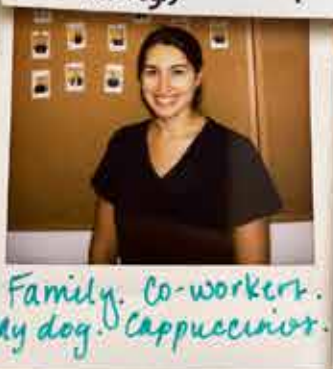
Family. Co-workers. My dog. Cappuccinos.