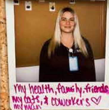
My health, family, friends, my cats, & coworkers ♡