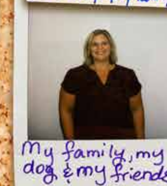
My family, my dog, & my friends!