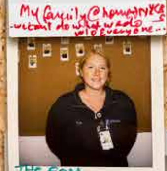
THE FAM Coworkers, Conferences & RAINBOWS. country music