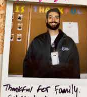
Thankful for Family. (and the dogs)