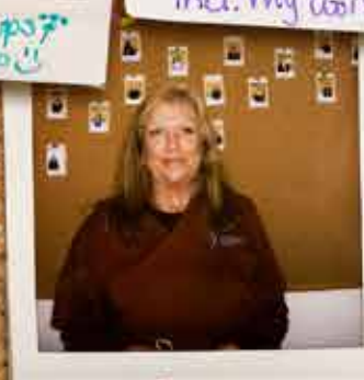
my family ♡