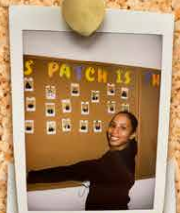
Life, my kids, for babies, friends, family + co-workers