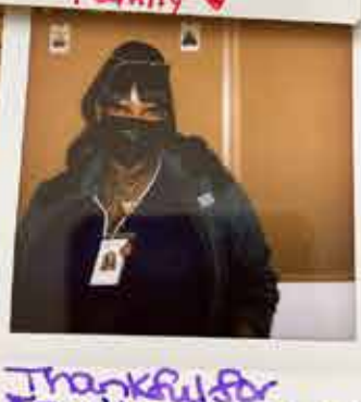
Thankful for Family, Friends, & lots of love.