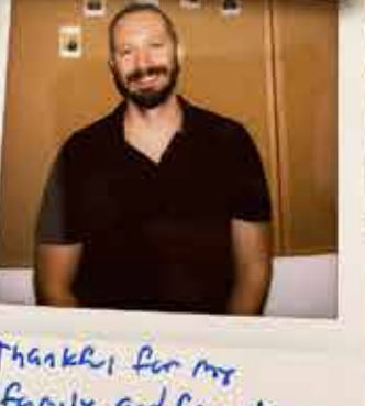
Thankful for my family and friends