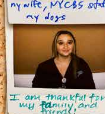
I am thankful for my family and friends!