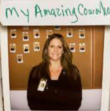
Family, friends, & health