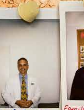
My family at home and my new friends here!