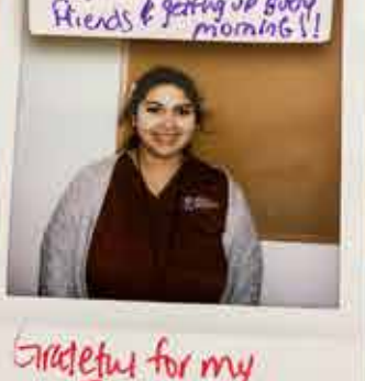
Grateful for my Family ♡