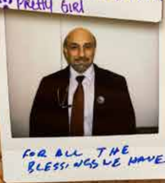
FOR ALL THE BLESSINGS WE HAVE