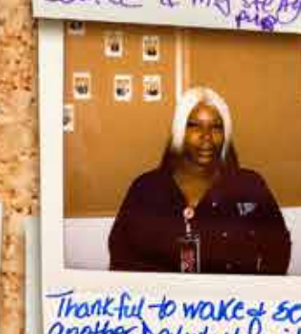
Thankful to wake & see another day w/ my family