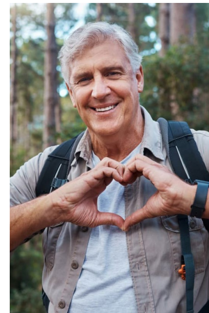
Walks around the neighborhood, park or leisurely hike through the woods, all bring about a magical feeling of being connected to something bigger than ourselves.

The World Health Organization suggests that approximately 30-50% of all cancers can be prevented. Engaging in lifestyle modifications, such as adopting a healthy diet, incorporating regular exercise, quitting smoking, and moderating alcohol consumption, can play a crucial role in enhancing your overall well-being and leading to a more fulfilling life. Striving for at least 150 minutes of moderate exercise per week is recommended, along with maintaining alcohol intake below one drink per day for women and less than two drinks daily for men. “As part of preventative care for my patients, I prioritize optimizing vitamin D levels. Low vitamin D levels have been linked